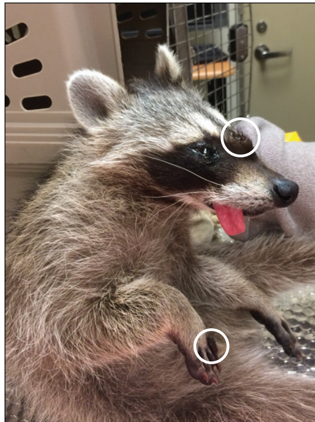
Fig. 2 Ulcerated exophytic lesion on the bridge of muzzle and dorsal aspect of the right second digit, where biopsy was taken.

Histopathological findings from the toe biopsy were consistent with raccoon papillomatosis. In Fig. 3, the biopsy contains koilocytes (indicated by the green arrows). These cells are mainly present in the stratum spinosum. No inclusion bodies are noted, but they can regress in later stages of infection. In Fig. 4, superficial epidermal proliferation supported by fibrocollagenous cores and