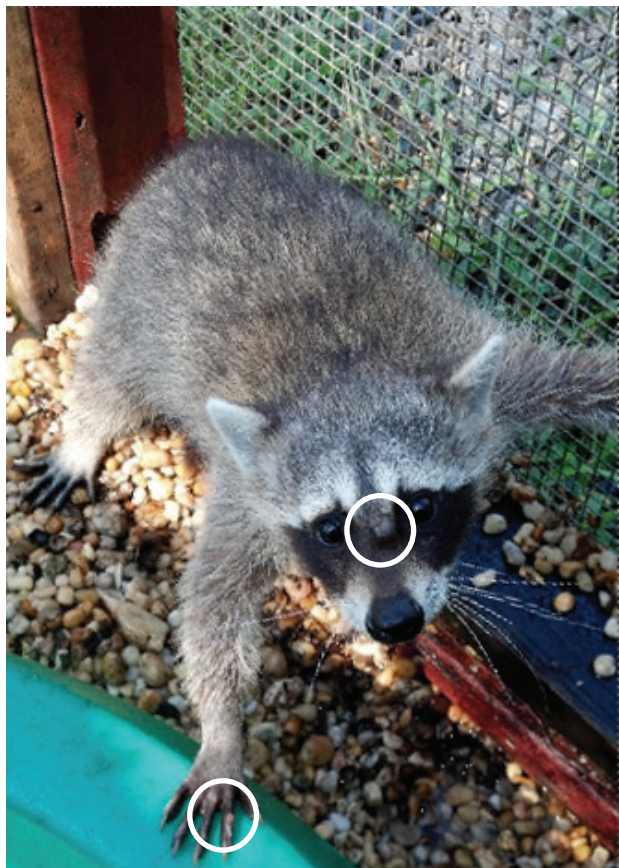
Fig. 5 Juvenile raccoon just prior to release. Ulcerations have healed, and papilloma has partially regressed.

A juvenile raccoon presented with ulcerated exophytic lesions on the bridge of its nose and second digit of the right forelimb. Toe biopsy was taken and sent to histopathology for a definitive diagnosis. Although no inclusion bodies were seen in the tissue, the diagnosis of papillomatosis was made based on the presence of koilocytes, a parakeratotic hyperkeratosis, and a hyperplastic stratum spinosum. Papillomavirus lesions are believed to be self-limiting; therefore, the only treatment necessary was medical management of the ulcerated skin. Once the ulcer was healed, the raccoon was ready for release. Papillomavirus lesions in raccoons are typically found on the digits, are exophytic, and will regress within weeks. Since it is not necessary to hold the raccoon in the facility while the lesion regresses, it is important to diagnose both