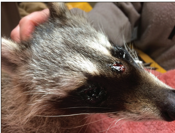
Fig. 1 Ulcerated firm skin lesion on the bridge of muzzle.

A juvenile raccoon recovered from a citizen's backyard in New Jersey presented with exophytic firm erosive lesions on the bridge of the muzzle and dorsal right front digit at Mercer County Wildlife Center in New Jersey (Figs. 1 and 2). The raccoon was anesthetized, and an excisional biopsy of the right second digit was taken and