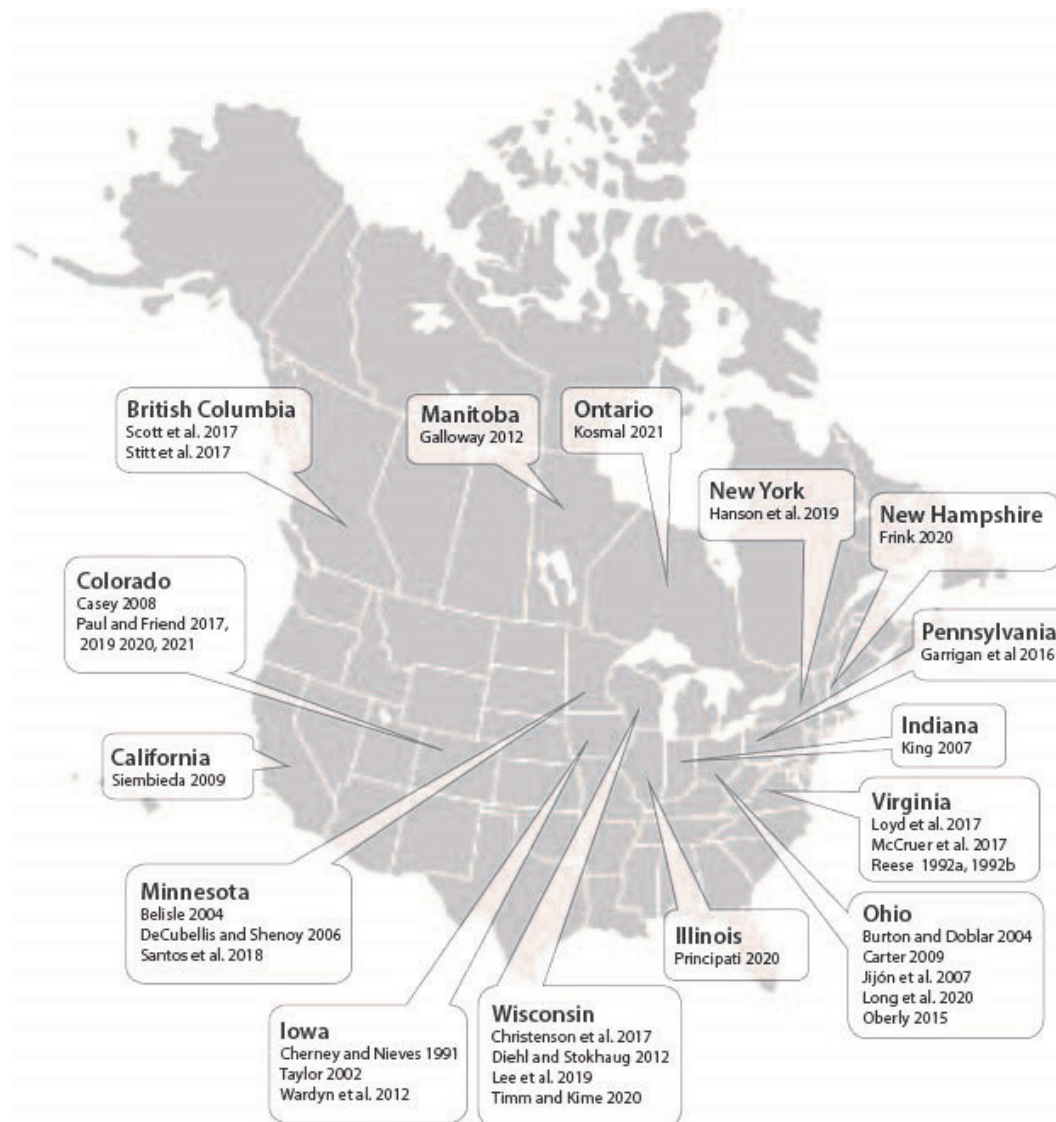
Fig. 2 Map of locations in which literature on rehabilitated eastern cottontails was published in Canada and the United States from 1991–2021.

literature on other wildlife species, and what aspects of rehabilitative care are discussed. The results of this study reveal significant gaps in the published literature from which rehabilitators could share rehabilitated eastern cottontail protocols. However, knowledge among rehabilitators is often communicated orally, and therefore these practices may have not been documented in this review. The existing literature primarily focused on the reason for admission and its impact on release. Release rates of eastern cottontails are highly variable and reported as 35% (Oberly 2015; Garrigan et al. 2016), 39% (Santos 2018), 45% (Hanson et al. 2021), 47% (Frink 2020), and 33 and 53% (depending on the milk replacer used) (Paul & Friend 2017). Some variation in the release rates can be explained by the different protocols characterized in