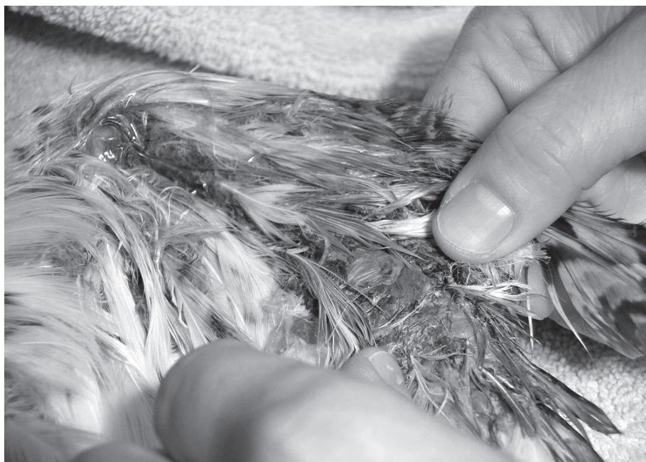
Figure 4. Edema and bruising resolving on left wing on day eight.

The next step was to assess the bird's flight ability. On 29 February 2008, almost two weeks post-admission, the bird was placed in a 16.8 m x 2.4 m x 2.7 m (55 ft x 8 ft x 9 ft) indoor flight hall containing perches on either end. The bird was able to fly the distance but indicated a definite weakness in the left wing. Additional cage rest was recommended.