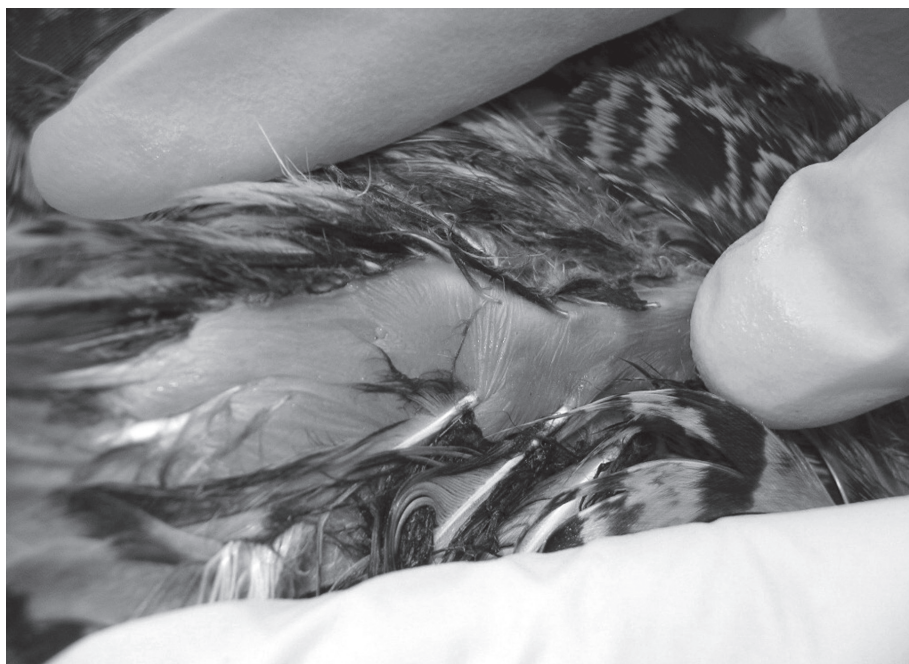
Figure 3. Edema appearing over left metacarpal bones on day three.

Eleven days following admission, a repeat CBC was taken to assess the bird's general health. The bird had a PCV of 35 percent, TS of 3.2 g/dl, and WBC estimate was 19,250 cells/mcL. The differential cell count was 63 percent heterophils, 22 percent lymphocytes, 8 percent monocytes, 7 percent eosinophils,